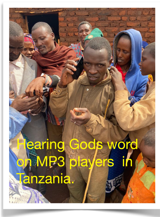
Hearing Gods word on MP3 players in Tanzania.